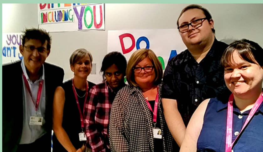
CLB visit to Bromley Mencap group at Glades event