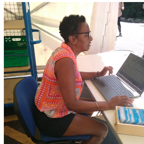
Projects funded by Bromley and Lewisham COVID-19 Giving Scheme. Left to right: MyTime active physical activity programme session; Grove Park Youth Club youth-led-holiday programme; Living Well Bromley debt advice and support session

O ur funding work remains important to ensuring that the sector continues to thrive in Bromley. We undertake horizon scanning and signposting to ensure the sector receives timely information about funding opportunities; provide advice on bid-writing; as well as leading on and facilitating sector-wide bids to attract and secure resources into the Borough.