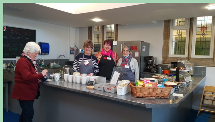
CLB outreach with Link Community Cafe in Orpington Baptist Church

O ur service continues to encourage volunteering and support volunteer involving organisations. We do this by supporting the recruitment of volunteers through operating a volunteer centre for the borough. This provides practical advice and guidance on all aspects of volunteering; raises awareness of the benefits of volunteering; provides a database of current volunteering opportunities and a volunteer online portal and phone line for people looking to volunteer.