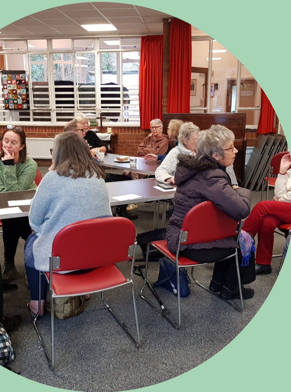
CLB outreach session to local Polymyalgia Rheumatica (PMR) and Giant Cell Arteritis (GCA) UK group

Our direct support to organisations was accessed by 233 organisations, a 12% increase on the previous year.